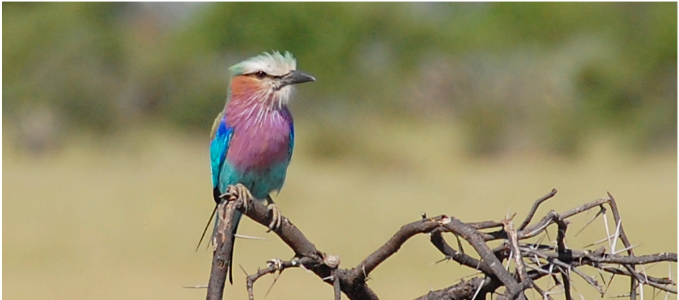
Steve Fury took this photo of a Lilac breasted roller in Botswana, Okovango Delta.