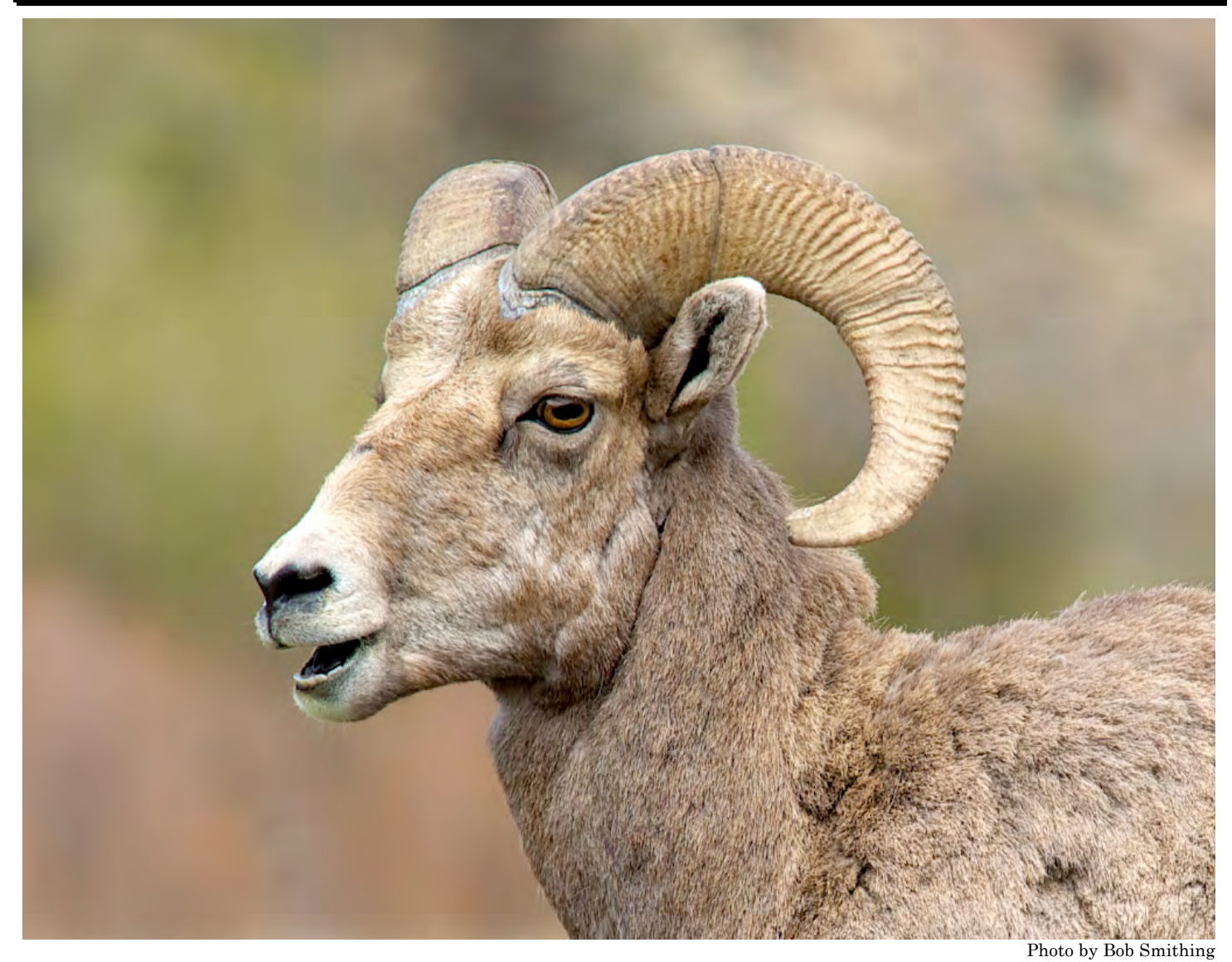
Big horn sheep looking forward to what ARNPs can accomplish in 2013.