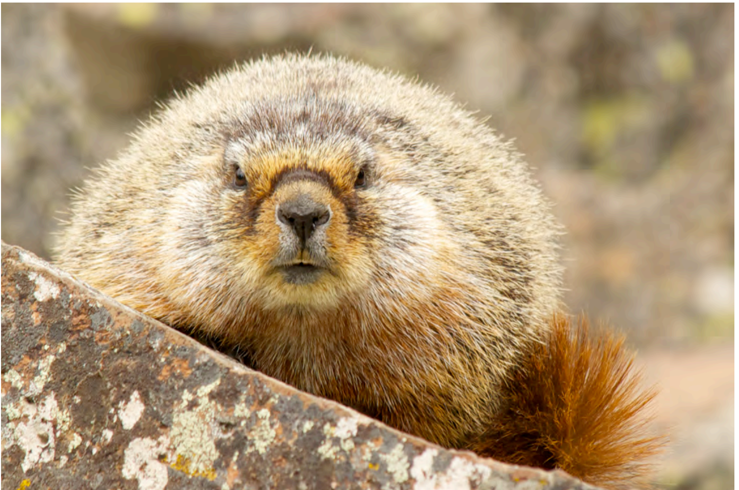
Happy Ground Hog Day! This Yellow-Bellied Marmot came to crash the party.