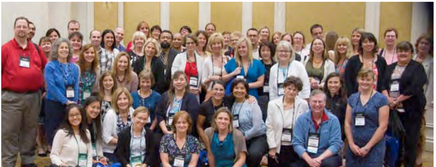
Some of the Washington State NPs and NP students at the June AANP Conference.